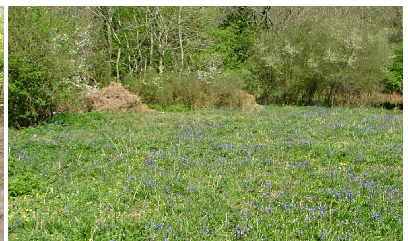
WOODLAND EDGE ECOTONE