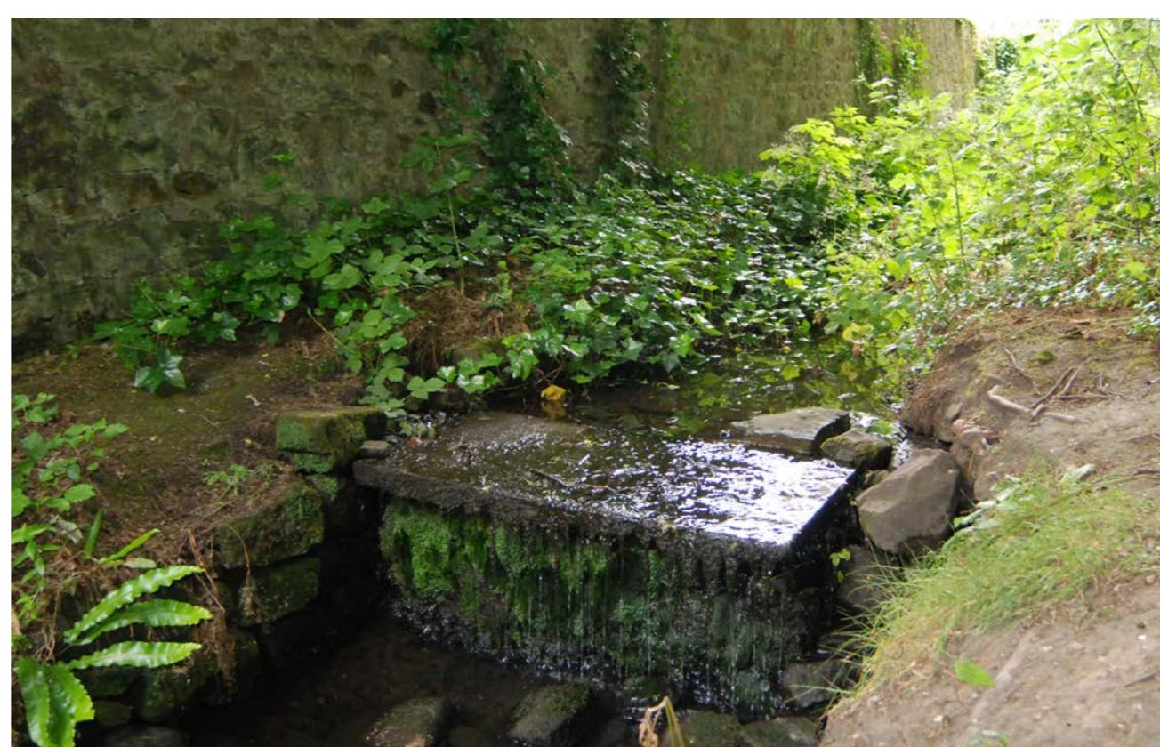
JORDAN BURN AT WOODBURN HOUSE