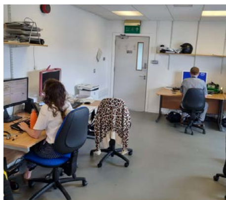
Office space, after

A suitable permanent location has since been identified within the hospital for the new office. To create a pleasant and comfortable working environment, funding from NHS Lothian Charity has gone towards new flooring, freshly painted walls and the purchase of 12 desks, chairs and pedestals plus 24 small lockers to allow belongings to be kept onsite and safe while not staff not at their desks. Staff were asked their thoughts on the project.