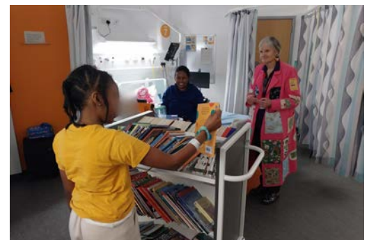
Patient picking a book from the trolley

Ross, Voluntary Services Manager, shares: "There is a continued need to provide children with enriching activities that support their wellbeing and help minimise distress during their hospital stay. The book trolley plays a key role in meeting this need. The addition of the new trolley ensures the service can not only continue but grow in the years ahead, including the recruitment of an additional volunteer to increase the number of ward rounds each week."