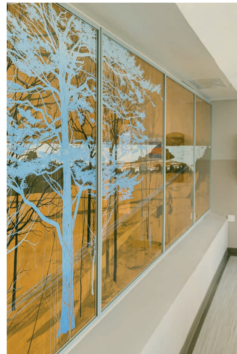
Blue Cedar, Silver Water © Andrew Mackenzie

Andrew Mackenzie's Blue Cedar, Silver Water , is an enormous painting which gives the viewer ample material to decipher. Split into four panels and spanning five metres in total, it is a layered panorama, depicting the Firth of Forth on a majestic scale. Mostly, Mackenzie has used a restricted colour palette; golden brown and silvery white, with delicate dark grey lines to add tone and shading. The panels on the left contrast starkly, dominated by a huge cedar tree painted in electric blue, so bright it almost looks like a negative from a photograph. He uses the same colour to depict the Queensferry